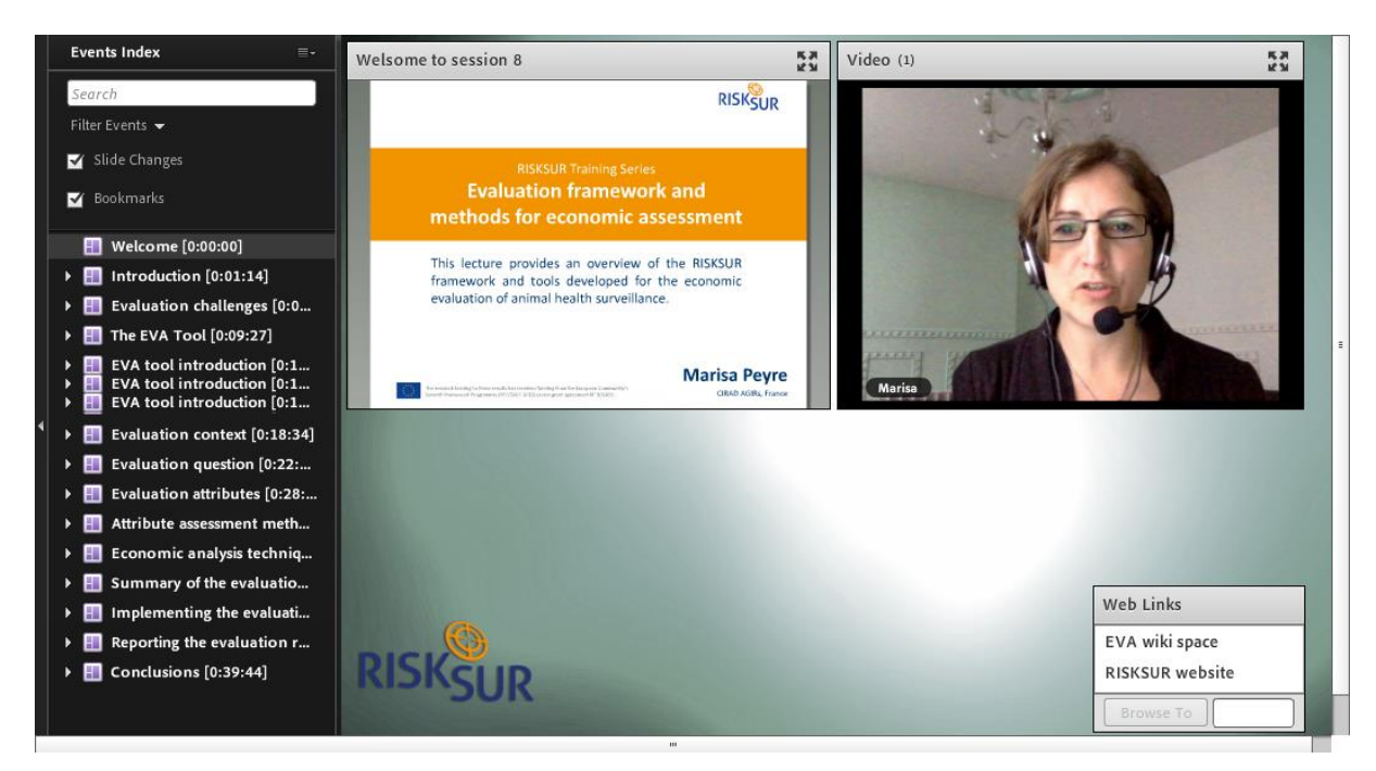
Figure 1. Welcome Layout